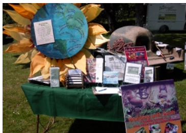
ICC Food Festival Fort Rodd Hill