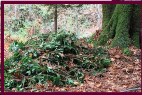
Left: Pile of removed daphne.

Add to this, a detailed and colourful explanation about the area systems by Todd Carnahan to start the day and a salmon barbecue wrap up. Could it get any better? Yes. Two weeks later in the same area a coho salmon was seen spawning - we can make a difference.