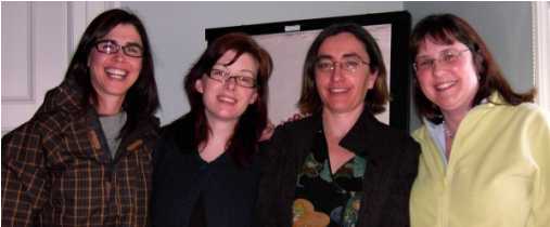
Green Moms from RRU and CEI's Healthy Children, Healthy Planet Discussion Course