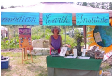
Organic Island Festival July 4 & 5