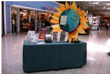
Earth Day April 2009 Mayfair Mall