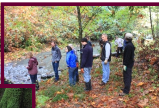
Learning about creek habitat.

chopped down to mulched with cardboard and chipped trees; and one hundred native plants were added to the properties backing on Chan Creekside Park. Now that is efficiency.