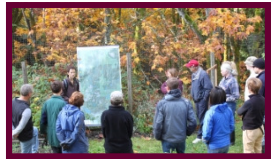
Salmon-bearing Millstream Creek Watershed covers 26 square kilometers.